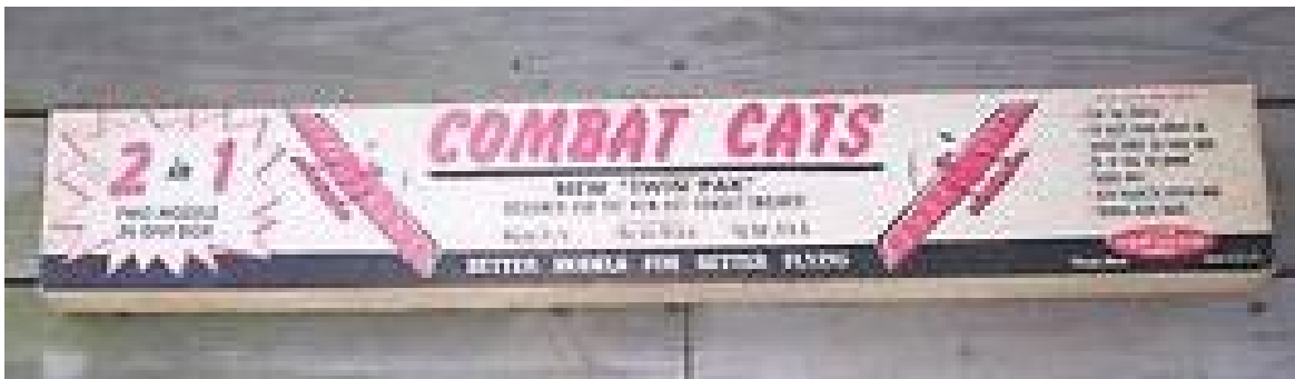
In 1961 the hot combat kits available at your hobby shop were the Top Flite Combat Cat and the Carl Goldberg Voodoo both kits released that year